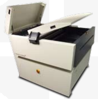
Shown with additional options